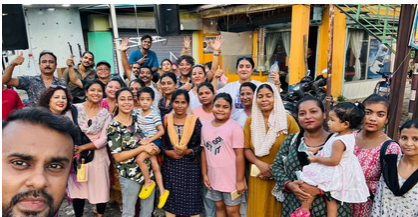
"Say No to Drugs" campaign in Siliguri, West Bengal