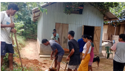
Rongrengpal Church of South Garo Hills getting ready for 3days leadership programme.