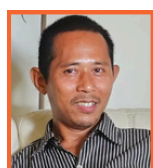
Pr. Hardingson A Sangma South Garo Hills Meghalaya

Embark on an exhilarating 6 km trek from the Canyons to Smit village, where you will be treated to stunning panoramic views, verdant paths, and the sight of four cascading waterfalls at the 270-degree viewpoint.