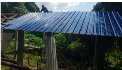
Construction of Village knowledge center in progress in Maingittim, South Garo Hills, Meghalaya